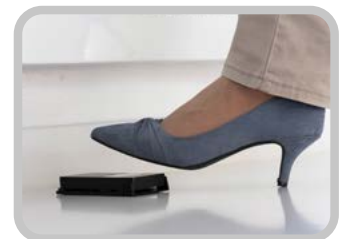
ALARM BUTTON ACTIVATED BY FOOT OR KNEE