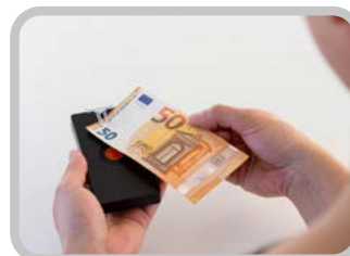
DETECTION OF BANKNOTE OR VALUABLE DOCUMENTS