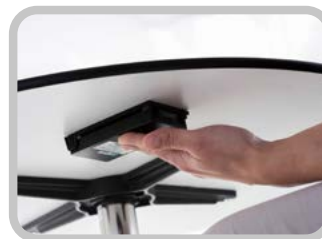
ALARM BUTTON ACTIVATED BY HAND