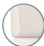
MTPADS-M Silver - Metal