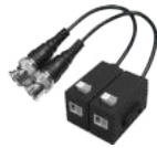
PFM800-E Passive HDCVI Balun